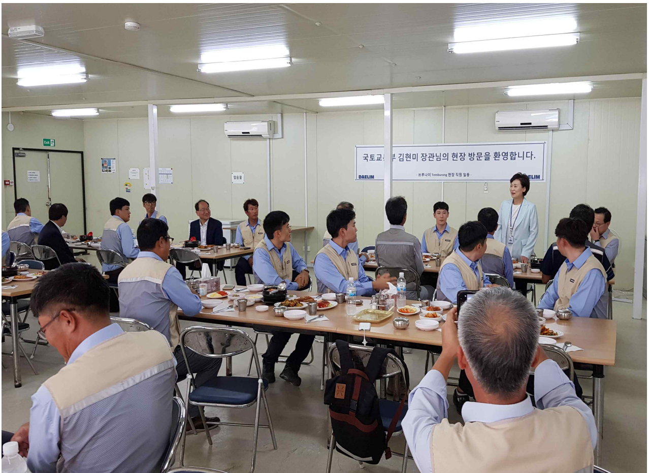
《 현장 사진 》