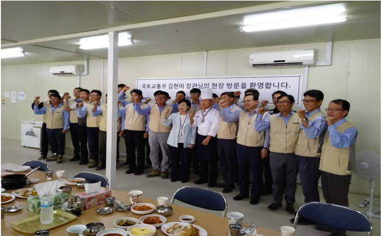
《 현장 사진 》